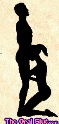
The Oral Slut.com